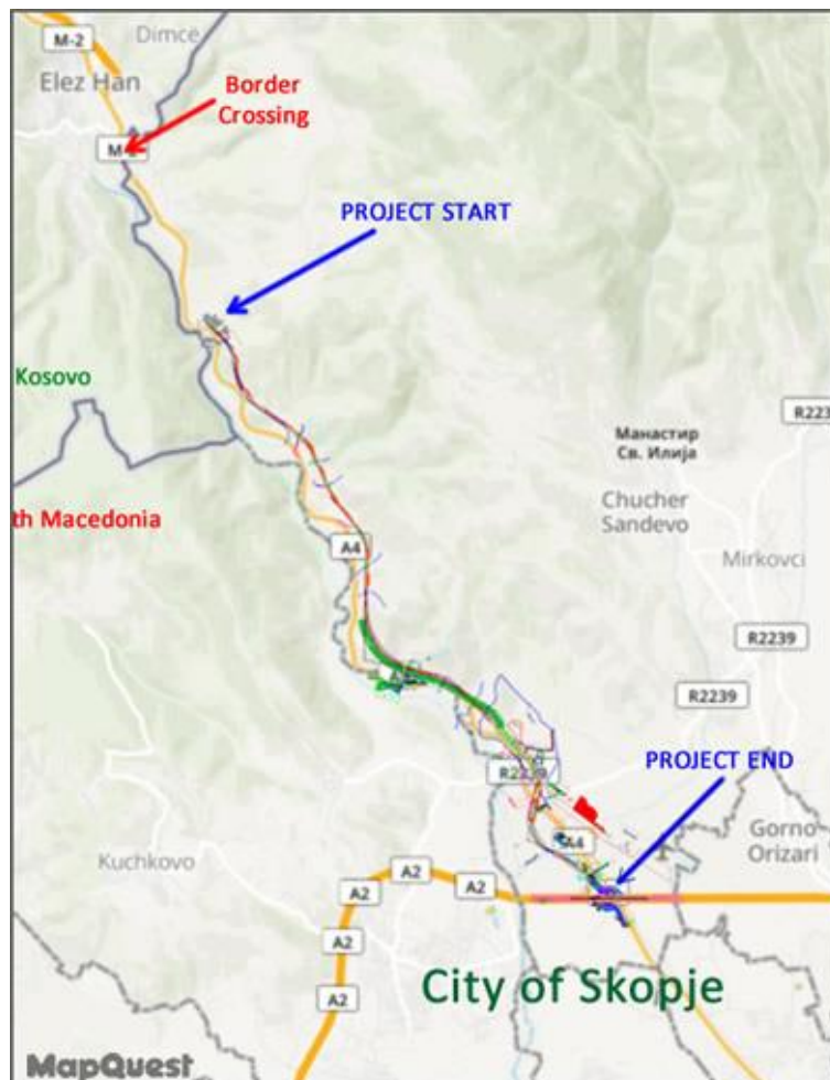
Figure 2 Map of project location in relation to the existing road infrastructure

The beneficiaries of the Project, the Ministry of Transport and Communications and the Public Enterprise for State Roads, undertake activities for preparation, completion and adjustment of the design documentation for construction of section of the Motorway A4 Skopje – Blace: "Construction of motorway from Interchange with local road for village Blace (interchange "Blace") to Skopje (Interchange "Stenkovec"), km 2+000 to km 12+250".