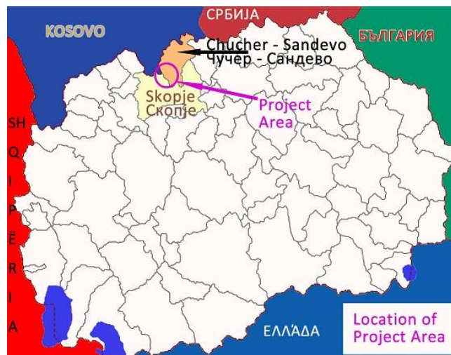
Figure 1 Map of location of the Municipality of Chucher-Sandevo

Project area consists of one municipality: Chucher - Sandevo.