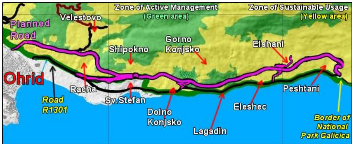
Figure 3: Road Alignment Showing Settlements and National Park Boundary