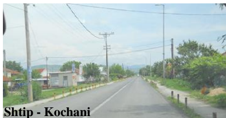
Shtip - Kochani

Project: REHABILITATION AND RECONSTRUCTION OF STATE ROAD A3, SECTION SHTIP – KOCHANI, ON A LEVEL OF EXPRESSWAY