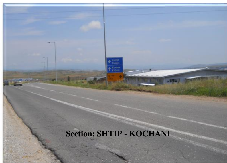
Figure 3 – The start point of the Project (Shtip Interchange)

The figure below illustrates the start of the road (Shtip Interchange).